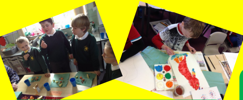
Rainforest Day in Year 3 Children created fantastic parrot artwork, tasted an array of tropical fruits and took part in a debate on deforestation.