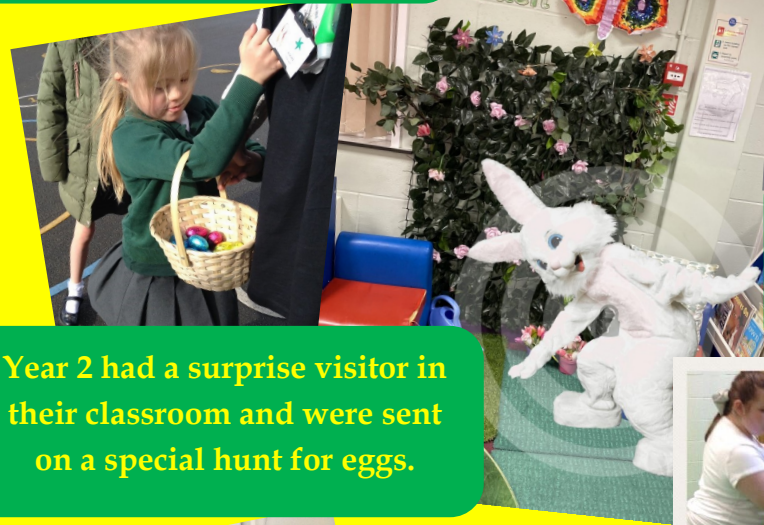
Year 2 had a surprise visitor in their classroom and were sent on a special hunt for eggs.